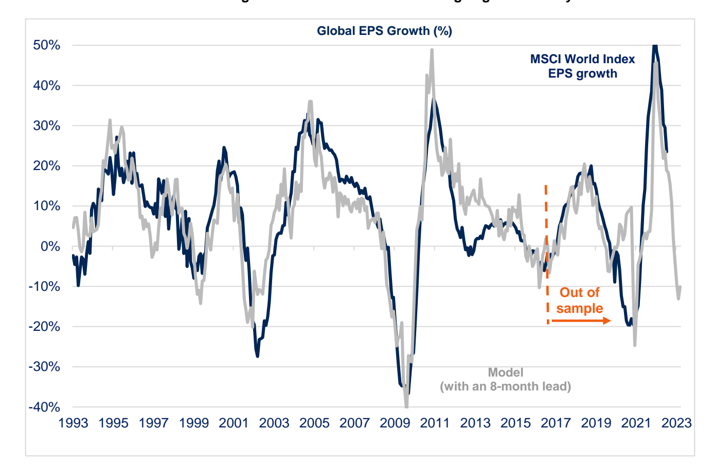
Chart 7: Global EPS growth is flat for 2022 and turning negative in early 2023.